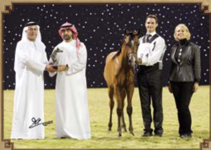
KanzAlbidayer - Ajman 2010

Kanz Albidayer's pedigree is a magical blend of the breed's greatest individuals; each generation is filled to the brim with beauty, quality and success. Kanz Albidayer is sired by Ajman Moniscione (WH Justice x Anthea Moniscione), a stallion known as the "master