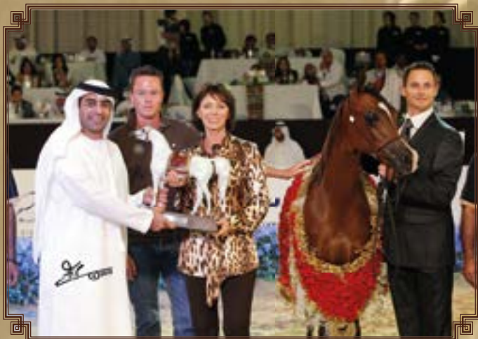
KanzAlbidayer - Dubai 2010

painter of living art." This exotic, chestnut stallion got his nickname because of the outrageously beautiful foals he has been producing and Kanz Albidayer