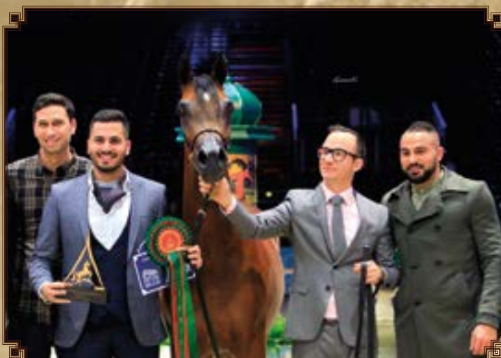
Seranza - Yearling Filly Silver Champion - Paris 2017