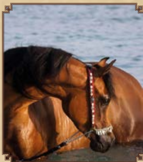
DL Marielle - Dam of Kanz Albidayer