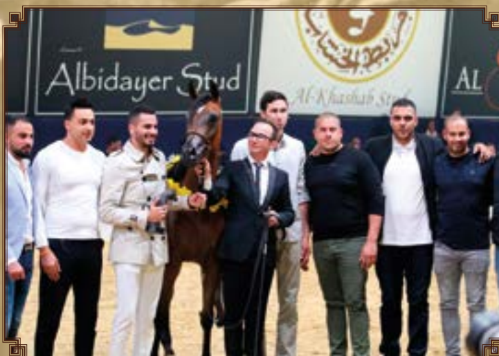
Seranza - Bronze Yearling Filly - All Nations Cup - Aachen 2017