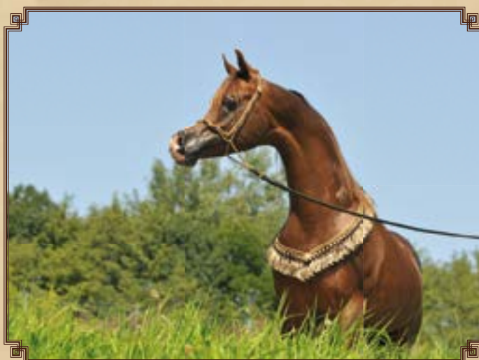
Ajman Moniscione - Sire of Kanz Albidayer