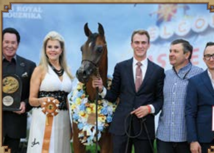
Seranza - Bronze Yearling Filly AHBA breeders cup 2017